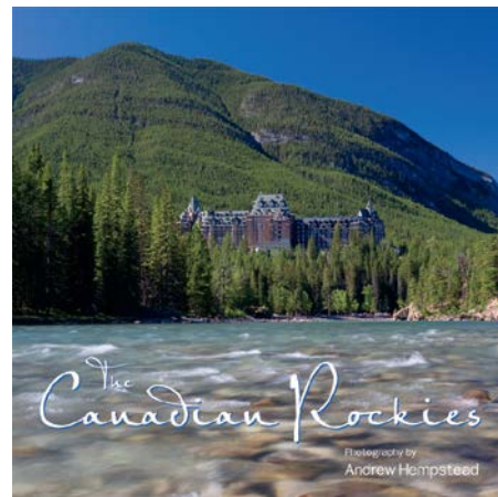
Banff Springs cover | ISBN 9780981149127